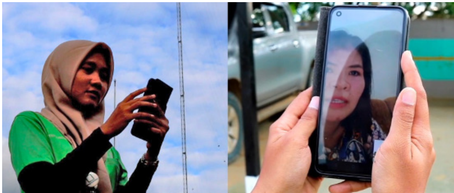
TAPG Staff video calling her mother from one of TAPG Estate Site: YWA, 3 hours from Berau (East Kalimantan).

These days, the era of you have to travel hours from estates just to make a phone call and connect to family or your beloved one already become history. Our young millennial talents can conveniently make video calls from our residence areas, accessing their favorite YouTube channel, following their Instagram idols, exists in social media, almost as convenient as their friends living in big cities. Technology has become their way of life.